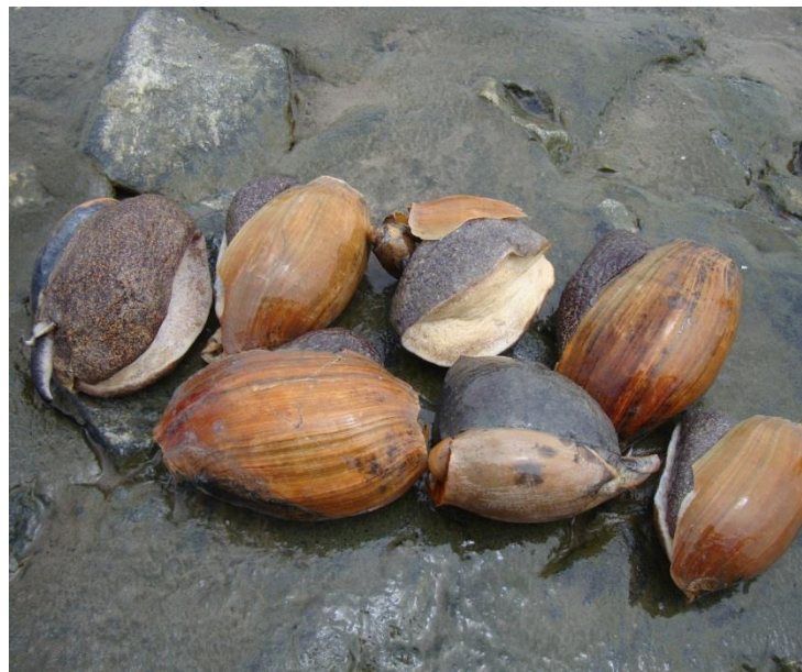
Figure 5: Cymbium glans , a Marine Snail.

Mollusks such as bivalves are highly exploited by the adult female and youth coastal dwellers. The mangrove oysters ( Crassostrea gasar ) and whelk ( Thias callifera ) occur abundantly in the coastal swamps and estuaries where they are exploited at subsistence level. Other bivalves harvested include the clams, Senilia senilis , Anadara senegalensis and bloody cockles, Cardium costatum . Other mollusks like periwinkle, Tympanotonus fuscatus and Cymbium glans (Figure 5) are also harvested abundantly.