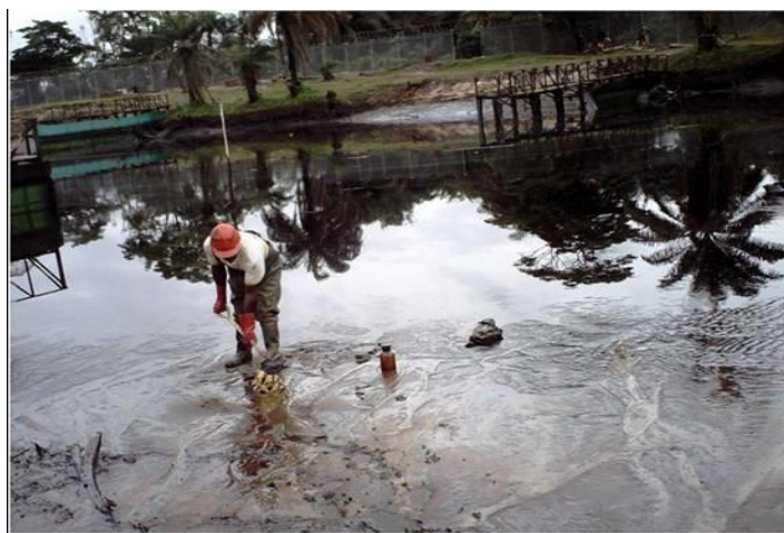
Figure 17: Oil spill on shoreline.

Although the influence of petroleum E and P activities on the production and management of seafood resources may have existed unnoticed since the origin of oil activities in 1903 when crude oil exploration started in Nigeria, its obvious manifestation may have been very recent. In Akwa Ibom State in particular and Nigeria in general, it became obvious when the first major oil spill disaster occurred from Idoho Platform of Mobil Producing Nigeria Unlimited on 12 January 1998. The spill traversed the entire Atlantic Ocean shoreline up to Lagos lagoon. Figures 17 – 18 below show some oil spill scenes in the Niger Delta region, Nigeria. When this happened, seafood resources in the country were adversely affected and the spiral effects on socio-economic activities of the country can not be over-emphasized.