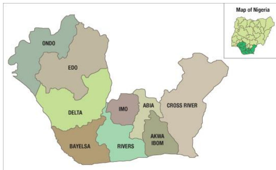
Figure 7: Map of the Niger Delta region.

The Niger Delta is endowed with immense natural resources, especially hydrocarbon deposits. Crude oil production and export from the region, in the range of two million barrels a day, dominates the Nigerian economy, accounting for over 90% of the Nation's total export earnings [18].