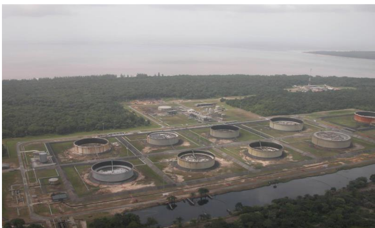
Figure 12: A typical Petroleum Tank Farm / Terminal that can experience oil spill.

In downstream operations of the petroleum production activities, oil terminals, tank farms (Figure 14), depots, pipelines, tankers, trucks, filling stations, and so on spill oil into the environment which ultimately end up in water bodies with its adverse impacts on seafood [7].