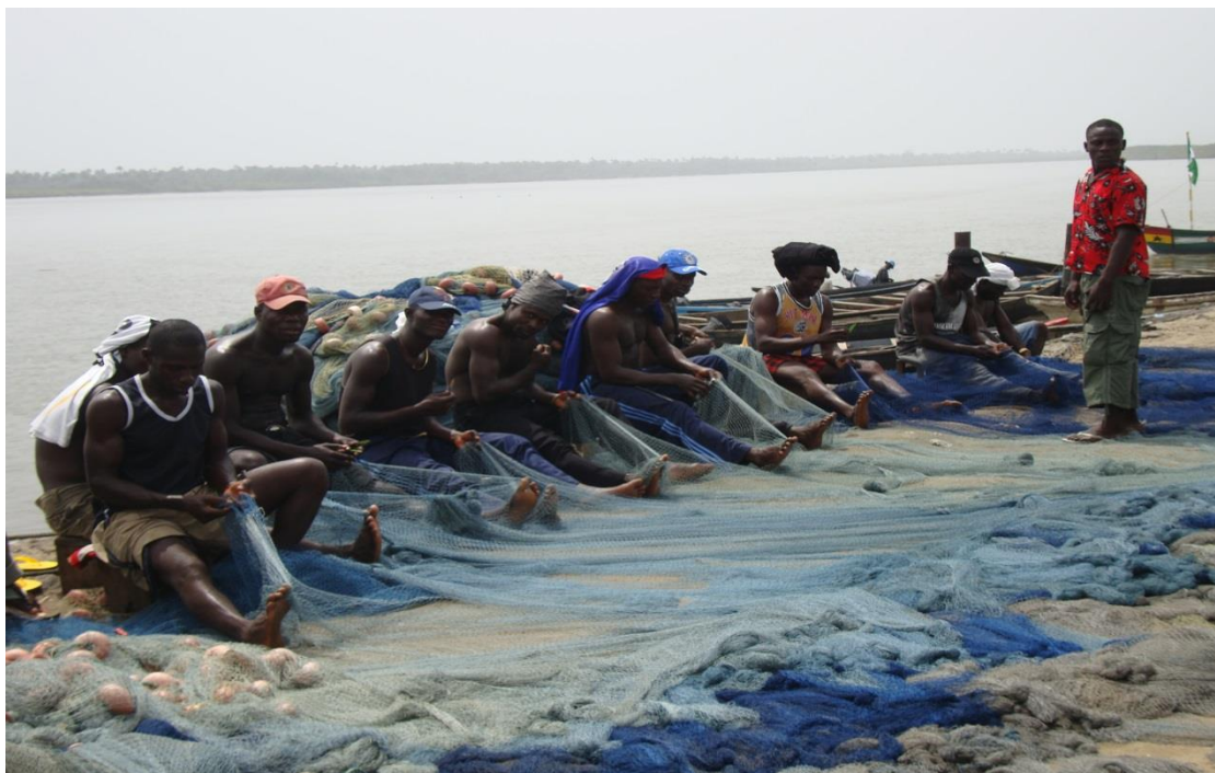
Figure 19: Fishermen hanging their nets due to oil spill at Upenekang beach.

Upton (2011) in a report to members of Congress (Congressional Research Service, CRS), summarized the effects of the Deepwater Horizon Oil Spill and the Gulf of Mexico Fishing Industry as follows: