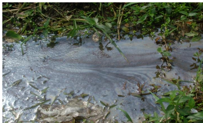
Figure 18: Remote Aviation fuel spill scene after 12 years.