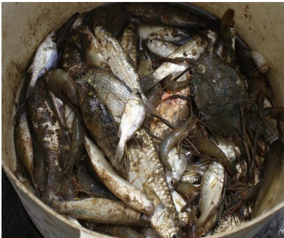
Figure 3: A typical fish landing.

2.2.2 Offshore pelagic fishery: Tuna and tuna-like fishes such as skipjack ( Katsuwonus pelamis ) yellow fin ( Thunnus albacares ) and brgeye ( Thunnus obesus ) are the targets of the state's offshore pelagic fishery. The tuna-like species identified within the state's coastal zone include Sarda sarda , Elagatis pinnulata and Euthynnus alleteratus . Figures 3-6 are some fish landings from inshore pelagic fishery in some fishing ports in Akwa Ibom State These are found within the Exclusive Economic Zone (EEZ) of Akwa Ibom State and the annual yield is estimated at 2,100 tonnes [13].