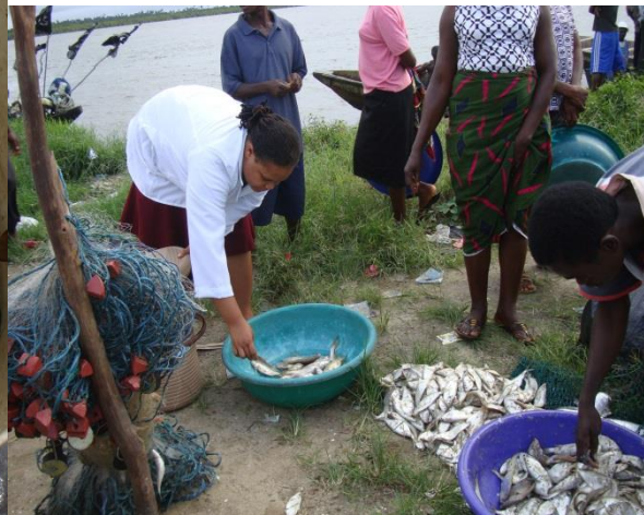
Figure 4: "Traditional" weight determination.

Figures 3 and 4: Some fish landings from Inshore Pelagic fishery in the State.