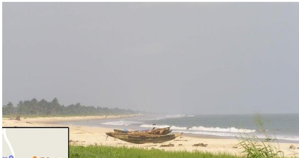
Figure 1: Some parts of the Akwa Ibom State Coastline of about 120 Km.

Much of the State's population and economic activities are located along the coast. According to the 1991 National Population Commission [11] census figures, approximately 0.68million people (about 49% of Akwa Ibom State population) inhabit the coastal area. The socio-economic activities in the coastal areas of Akwa Ibom State include petroleum drilling, fishing, transportation, tourism, etc with fishing being the most prominent (Figure 2).