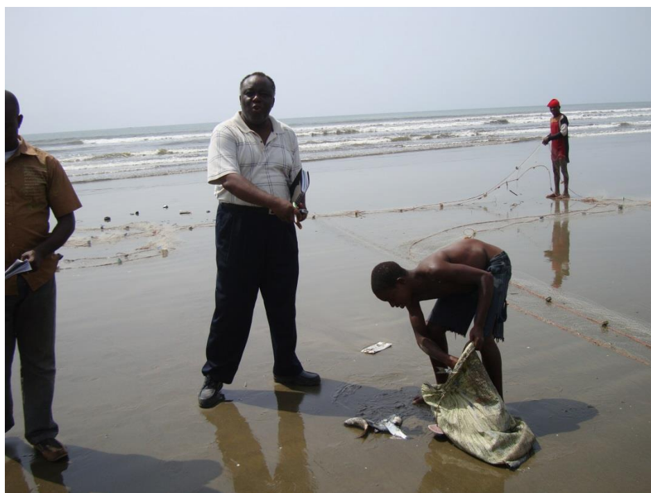
Figure 2: Artisanal Fishing at the background along the Akwa Ibom State Coastline.

Much of the State's population and economic activities are located along the coast. According to the 1991 National Population Commission [11] census figures, approximately 0.68million people (about 49% of Akwa Ibom State population) inhabit the coastal area. The socio-economic activities in the coastal areas of Akwa Ibom State include petroleum drilling, fishing, transportation, tourism, etc with fishing being the most prominent (Figure 2).