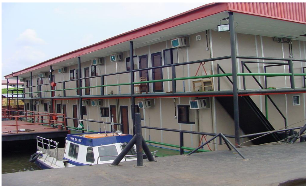
Figure 13: Wastes generated from Base camps like this House Boat affect Seafood.