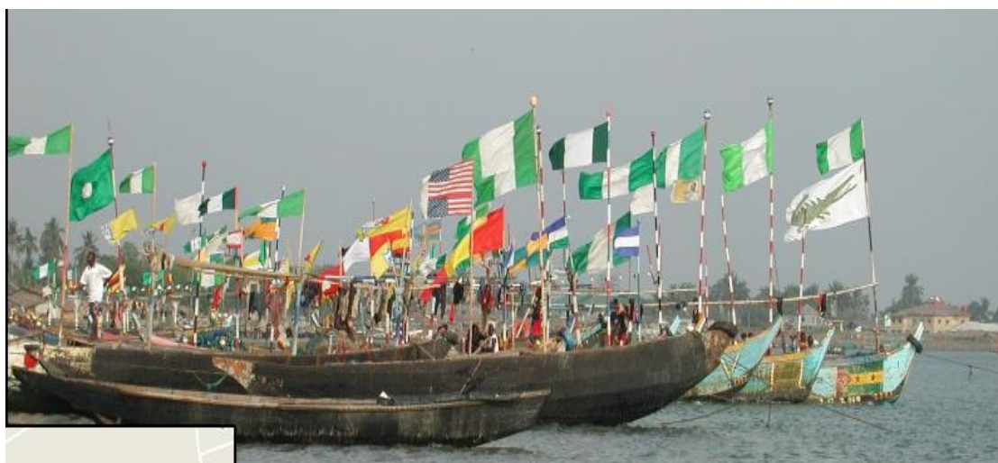
Figure 6: Fishermen's Boats at Upenekang set to sail out for fishing.

2.3.3 Industrial fisheries: The industrial sector of the Akwa Ibom State fisheries is the least developed. This is because it is characterized by high capital outlay on marine vessels, cold storage facilities and advanced technology (fish finder, rader, navigation and communication equipment). While the artisanal fishery sector concentrates on local markets, the industrial fishery sector targets both local and foreign markets. One major attribute of the industrial fishery sector in the state is its domination by foreigners (Ghanaians, Togolese, etc) (Figure 6) and its generation of foreign exchange through the exports of shrimps. The Ebughu and Uta Ewa fishing terminals are the most prominent in the industrial fishery sector within the Akwa Ibom State coastal zone.