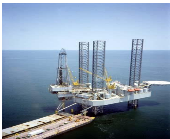
Figure 11: Offshore Production platform.

Several studies indicate that all phases of petroleum E and P activities generate wastes streams that could impact the environment negatively, if not properly managed in line with industries best practices [1, 12, 21], whether it is offshore (Figure 11), onshore (Figure 12) or in inland water. Table 4 presents the different phases of petroleum E and P activities and the likely impacts on seafood during the upstream and downstream petroleum E and P activities.