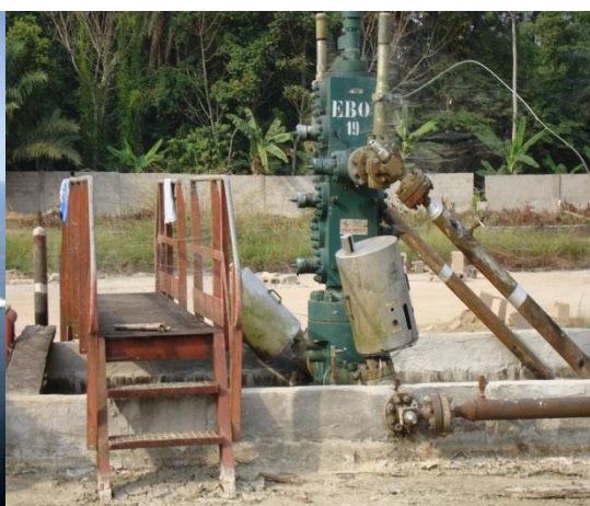
Figure 12: Onshore Oil well.