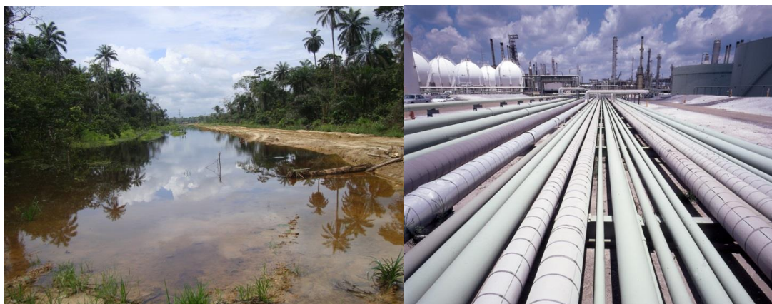
Figure 13: Buried Oil Pipelines.