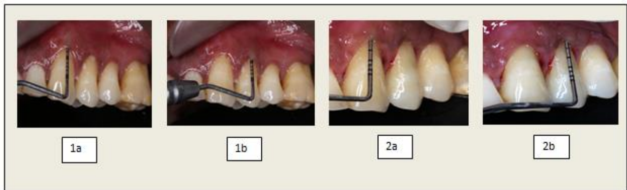
Figure 2: (1a, 1b) Pre-operative probing depth; (2a, 2b) Post-operative probing depth.