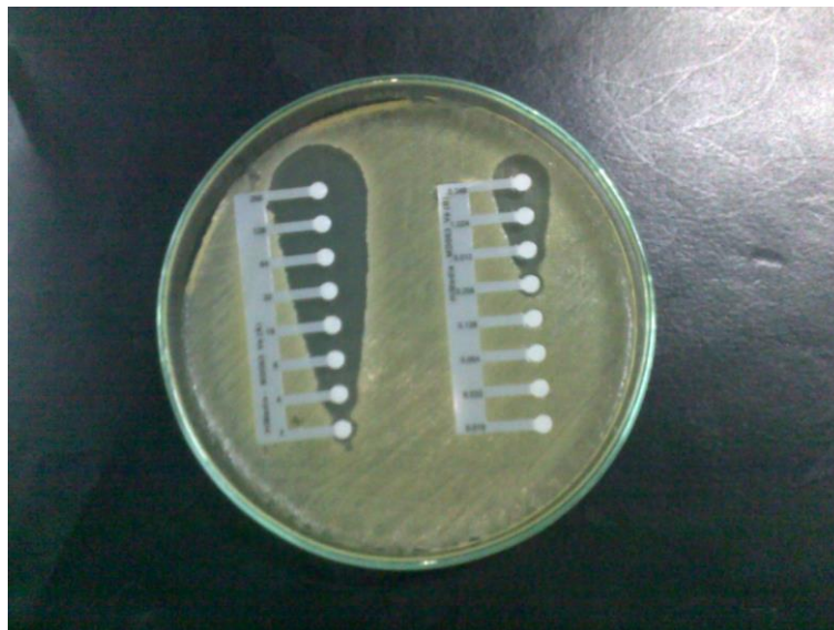
Fig 2: Vancomycin E - test