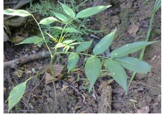
Fig.1. Photograph of Zanthoxylum oxyphyllum plant

As no pharmacological study has been carried out systematically to evaluate the anti-inflammatory and analgesic activity of Z. Oxyphyllum till date therefore an attempt has been made to study the Analgesic activity of the plant in correlation with the Anti-inflammatory activity on experimental animal models.