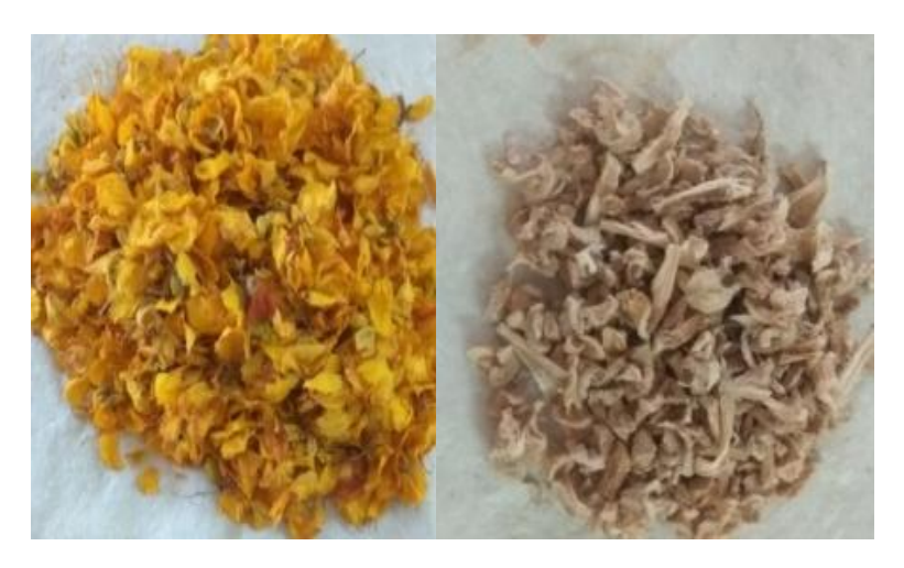
Fig-1: Flowers and Stem of Butea monosperma and Salvadora persica

Flowers and stems of the plant were collected and dried under shade at room temperature (Fig-1). The plant material was then chopped and ground to fine powder using a mechanical blender. 20gm of powder of flowers of Butea monosperma and rhizome or stem of Salvadora persica was taken into conical flask. The phytoconstituents were extracted by adding 100ml of ethanol to the powder. The flask was incubated in orbital shaker for 48 hrs. The extract was filtered through five layers of muslin cloth. The process was repeated twice. The collected extract was pooled and concentrated by evaporation (Siddiqui, et.al., 2009). The extract was preserved and stored at 4<sup>o</sup>C in airtight bottles for further study (Fig-2).