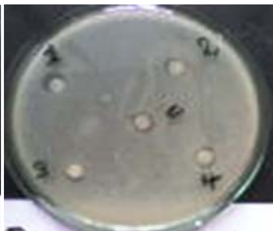
Fig 2: Staphylococcus aureus