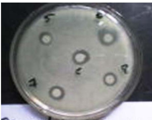
Fig 1: Pseudomonas aeruginosa