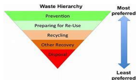
Figure 1: The Waste Hierarchy.

Waste prevention and reduction are placed at the top to show that the best way to deal with waste is to prevent its production and, where this is not possible, to produce less of it. At the other extreme, disposal is placed at the bottom to show that it should be the last resort among the strategies for waste management. In spite of efforts by municipal authorities to improve waste management, most countries in the world still resort to strategies at the bottom of the waste hierarchy. Other instruments that encourage good practice in waste management are the proximity principle (PP) and the best practicable environmental option (BPEO). The proximity principles call for the disposal of waste as close to its source as possible. Among other advantages, this practice reduces the time, energy and expenses involved in the transportation of waste to disposal sites, and also minimize the possibility of accidents associated with the transportation of waste. With regard to the BPEO, it encourages the use of waste management strategies that achieve the most benefits in terms of cost, energy and time, and that also cause the least damage to the environment.