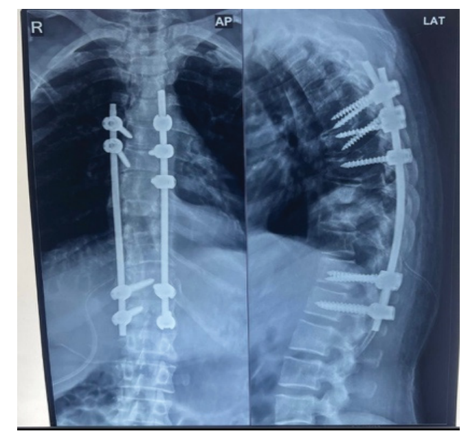
Figure 6: Post operative Xray showing planned pedicle screw instrumentation above and below the Involved levels to provide stabilisation

Schedule (DOTS) for further medical management of Tuberculosis.