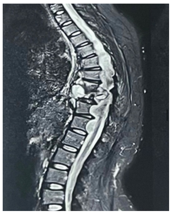
Figure 3: MRI D-L spine showing extension of the epidural abcess into above and below levels from the involved vertebrae

According to the reports, the patient was diagnosed with Multidrug-resistant Tuberculosis based on a positive gene xpert report. Following the operation, the patient was subsequently referred to a Direct Observed Treatment