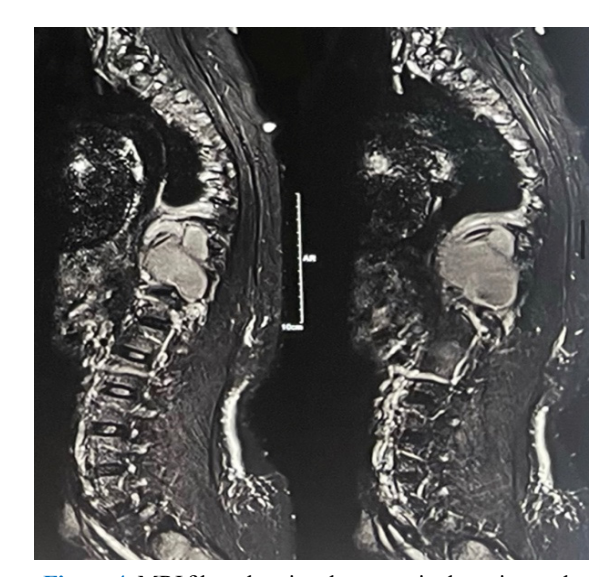
Figure 4: MRI films showing the paraspinal meningocele measuring 7*6.5*5.3 cm