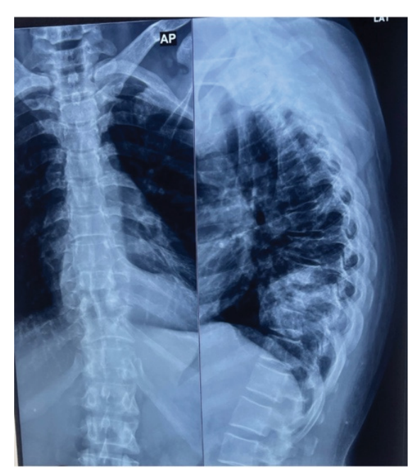
Figure 2: Plain Xray radiograph pf Dorsal spine in Anterio-posterior and Lateral view