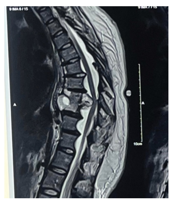
Figure 1: Plain MRI T-2 Image showing involvement of D10-D11 levels majorly

Following preoperative planning, the patient underwent decompression and fixation surgery through a conventional midline posterior approach, which involved transpedicular decompression of the spinal cord and drainage of the epidural