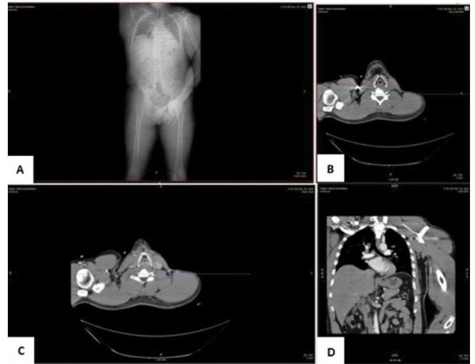
Figures 3A, 3B, 3C, 3D: CT-scan images showing no pneumothorax, no hemothorax and no evidence of vessel injury.