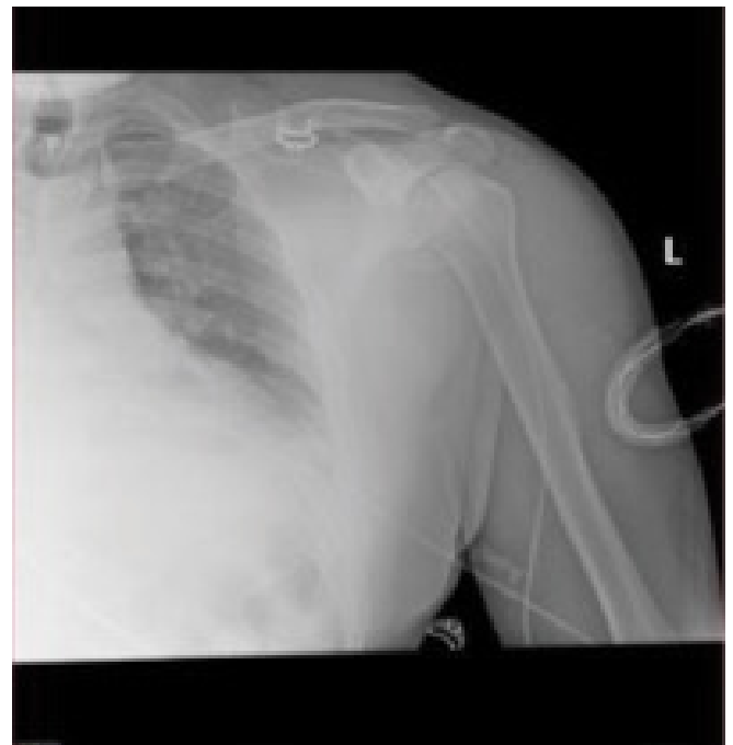
Figures 4: Post-operative plain radiograph after the bullet removal showing the left shoulder joint free of metallic foreign bodies and in anatomical position.

degrees (almost zero degrees preoperation). A follow-up with the patient 10 days after the incident showed improved pain with recovered forward elevation but limited external rotation. His wounds were clean after the debridement. The patient underwent 15 sessions of physiotherapy. At postoperative day 64, the patient had 90% recovery of the range of motion 'Figure 4'. 2 years follow-up with the patient showed almost complete recovery of active and passive shoulder range of motions with adequate strength and negative examination of impingement syndrome.