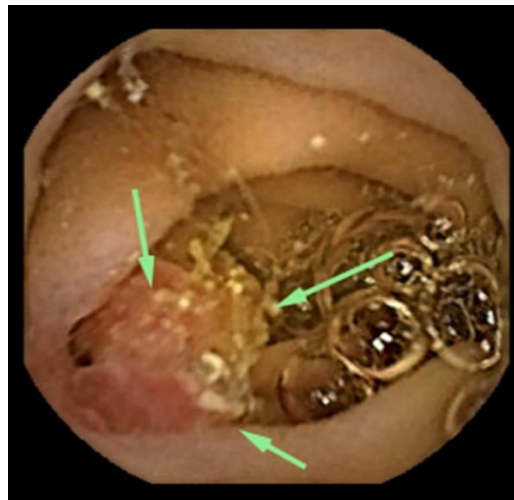
Figure 1: Video capsule endoscopy image. Smooth rounded lesion with eroded surface (arrows) without active bleeding located in the jejunum.

A CECT was performed that demonstrated a unique contrast-enhancing lesion on jejunum. The angiography CT tridimensional reconstruction revealed an aberrant vessel originating from an arterial branch of the superior mesenteric artery which ended in a dilated vascular structure in the mucosa of jejunum. Active bleeding was not observed (Figure 2).