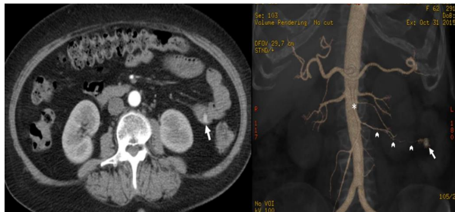
Figure 2: Abdominal contrast enhanced computed tomography and CT angiography images. (A) Hyper enhanced polypoid image on the proximal jejunum lumen (arrow) on arterial phase; (B) Vascular malformation (arrow) originating from an arterial branch (arrow heads) of the superior mesenteric artery (asterisk) by angiography computed tomography reconstruction.

A CECT was performed that demonstrated a unique contrast-enhancing lesion on jejunum. The angiography CT tridimensional reconstruction revealed an aberrant vessel originating from an arterial branch of the superior mesenteric artery which ended in a dilated vascular structure in the mucosa of jejunum. Active bleeding was not observed (Figure 2).