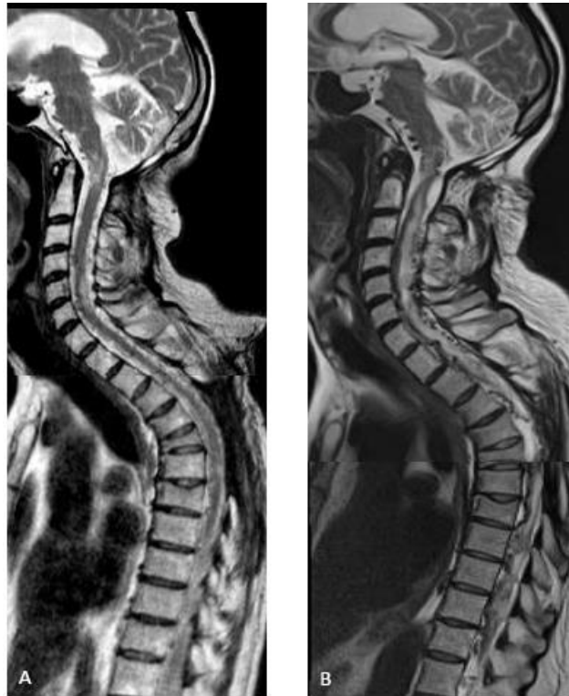
Figure 3: T2 w.i. showing: (A) time 17 and 6 months, during BEV treatment: focal medullary myelopathic hyperintensities, stable compared to the pre-BEV treatment (not displayed); (B) time 18 and 9 months (6 month after BEV stop): clinical-radiological further disease progression: cervical and thoracic diffuse myelopathy and engorgement of perimedullary veins due to solid enhancing lesions' mass effect.

No BEV-related adverse effects appeared. The patient gradually deteriorated, with severe limitation in the transfers: thus, he preferred not to cope any other adjuvant therapy except for supportive therapy based on pain killer, low molecular weight heparin as deep venous thrombosis prophylaxis and calcium.