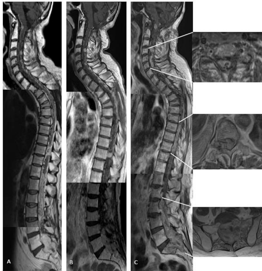
Figure 2: (A) time 17 and 3 months, just before BEV starting: MRI shows disseminated disease with focal lesions, all contrast enhancing (sagittal contrast enhancing T1 w.i MRI); (B) time 17 and 6 months: partial response during BEV therapy (sagittal contrast enhancing T1 w.i MRI); (C) time 18 and 3 months: clinical-radiological further disease progression (sagittal contrast enhancing T1 w.i MRI), including worsening of all spinal lesions with (right, top to bottom) transverse invasion of the spinal canal at C4-6 level, at Th8-10 also extending in the right foramina, and at L3-S2 with bone scalloping and destruction of sacrum on the left (axial T2 w.i MRI).