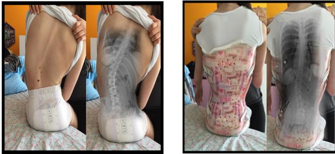
Figure 3: Clinical photographs without and with the DSB.

Figures 3 and 4 show the clinical and radiologic findings for an 18-year old woman (case 17). Figure 3 represents the clinical photographs with and without the DSB. Figure 4 shows the radiographs of this patient without (a) and with (b) the DSB.