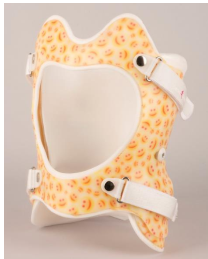
Figure 1: Custom-made brace.