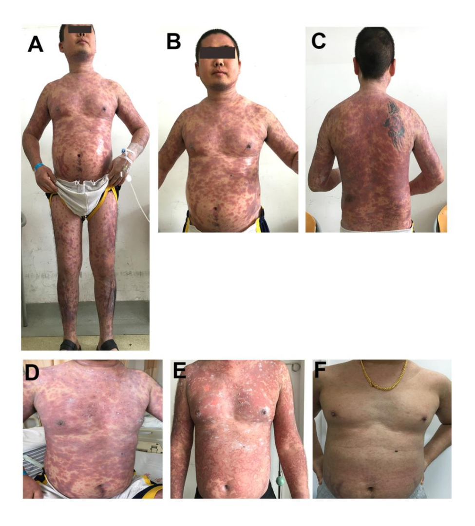
Figure 2: The patient developed systemic erythema multiforme on 20 days after surgery and changes of skin rash after therapy. The patient developed multiple symmetrical edema erythemas throughout the body (A, B, C). On the third day of treatment, the rash expanded and merged (D). After 14 days of treatment the patient's rash gradually subsided, and the skin was desquamate (E). The skin returned to normal on the 45th day of treatment (F).