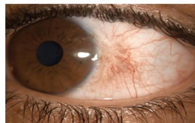
After a month