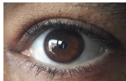
After a year