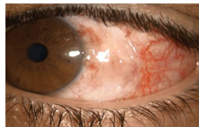
After 7 days