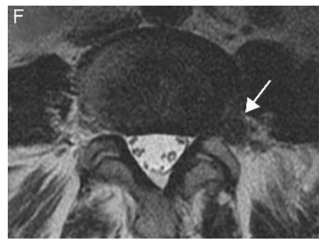
Figure 2: Lumbar disc Herniation at Foraminal space. Figure 3: Lumbar herniation at extraforaminal space.

They are also a special case because they affect the outgoing root instead of the descending root. For example, in the typical case of level L4-L5, the root affected by a herniated canal is L5, in its descending course towards the next foramen, while both a foraminal and an extraforaminal hernia, will affect the L4 root, with a different pain distribution. Regarding their prognosis and treatment, these types of hernias also have a different behavior than other common hernias. Unless they are very bulky hernias that cause paralysis or discs extremely disabling pain, with enough patience, most of these cases are resolved without surgery. With adequate treatment, it is likely that within 3 months the pain has disappeared or is very tolerable.