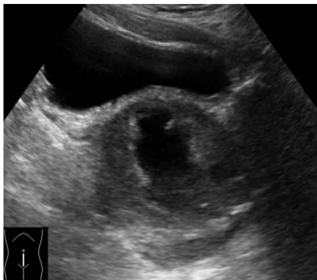
Figure 1: Ultrasonography demonstrated a huge prostate with a 45 mm x 24 mm multiloculated cystic