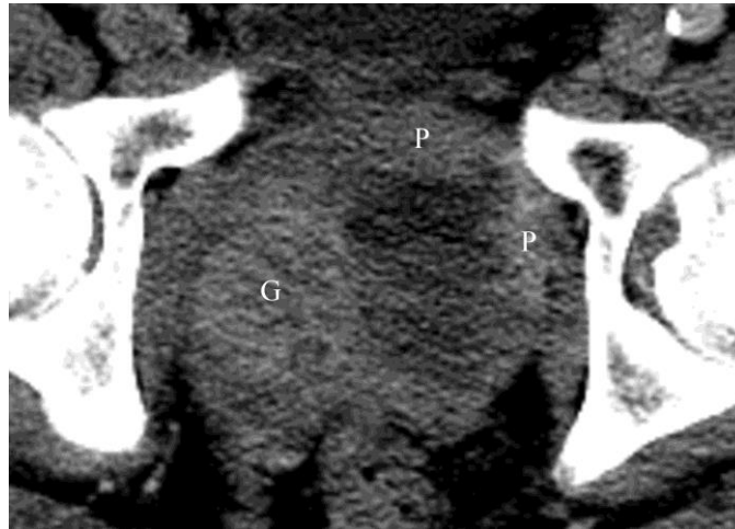
Figure 2: Delay-contrasted CT revealed a hypoattenuated lesion in left lobe with peripheral enhancement (P) similar to "ring of fire". Note that the well-enhanced glandular hyperplasia structure (G) on the right lobe.