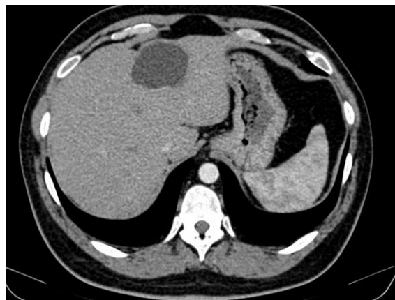
Figure 3: CT showing a cystic lesion of the liver.