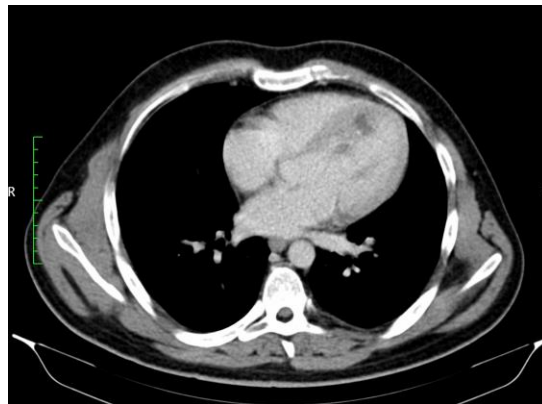
Figure 2: CT showing a cystic lesion on the interventricular septum.