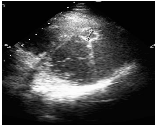
Figure 1: Echocardiographic aspect of the hydatid cyst located in the interventricular septum.