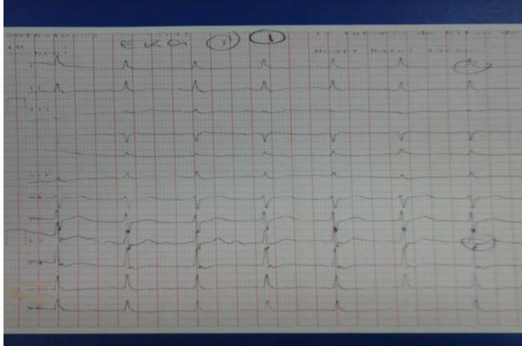
Figure 1: Patient electrocardiogram after CPR upon arriving to emergency services.

During his stay in the Shock area 48 hours after the event, the tubes were successfully removed. The neurological assessment showed no signs of cognitive impairment, no focalization data and a Glasgow Coma Scale (GCS) 15/15. A coronarography was performed, and it showed healthy arteries. Five days after the cardiac arrest event, an AICD was implanted as primary prevention strategy (Figure 2), which was placed on the eighth day with the following conclusions: a) idiopathic VT; b) recovery from sudden cardiac death; c) VDD BIOTRONIK pacemaker implanted. He was discharged 9 days after his admission, with GCS 15/15, neurologically intact, and he was scheduled for several follow-up cardiology appointments.