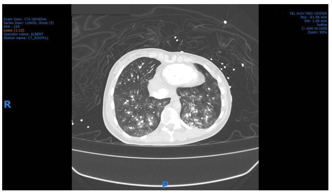
Figure 2: Computed Tomography angiography of chest exhibiting extreme pulmonary vasospasm.