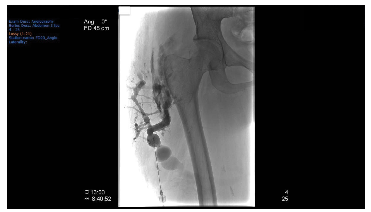
Figure 1: Angiography during sclerotherapy of venous malformation in gluteal area.

Sclerotherapy has replaced surgery in the treatment of venous malformations, as it provides less recurrence and better aesthetic results [6,7]. Ethanol is the preferred agent due to its low cost and high efficiency [6,8] but may rarely lead to cardiovascular collapse [9]. A possible mechanism is pulmonary artery vasospasm, with increased pulmonary artery pressure and strain on the right ventricle. Left ventricular cardiac output is affected leading to cardiovascular collapse