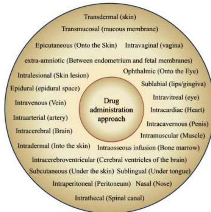
Figure 1: The scheme showing different drug administration approaches.